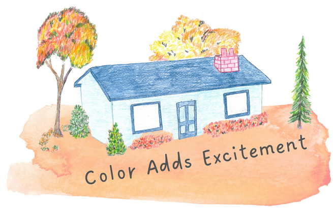
Illustrations by Tonia Underwood

Try Crape Myrtle, Beautyberry, and Sweetspire shrubs for summer color.