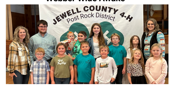
Jewell County 4-H King