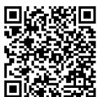
Kansas 4-H State Fair Website