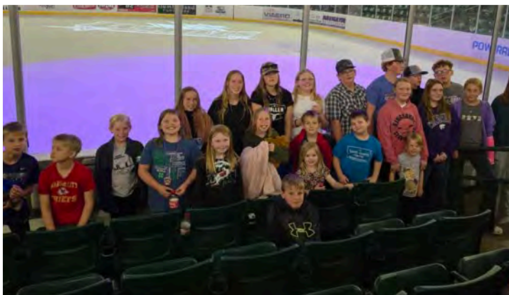
Storm Hockey 2025

Summer classes to come in June - watch for details to come.