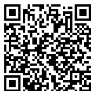
Frostings and Fillings Worksheet