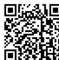
Smith County 4-H