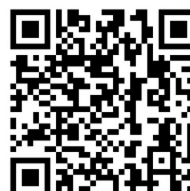
Mitchell County 4-H