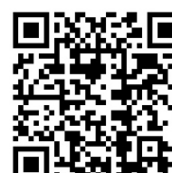
Osborne County 4-H