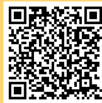
A 4-H Project: More than a Fair Entry