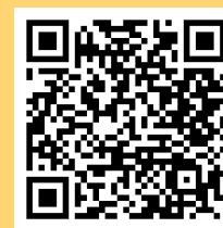
Kansas 4-H Clover Classroom