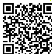
Jewell County 4-H