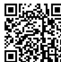
Smith County 4-H