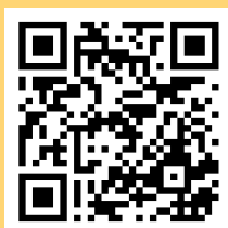
Kansas 4-H Project Resources (UPDATED SELECTION GUIDE!)