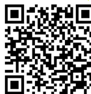
Jewell County 4-H