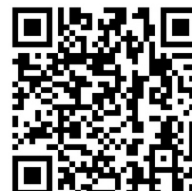
Mitchell County 4-H