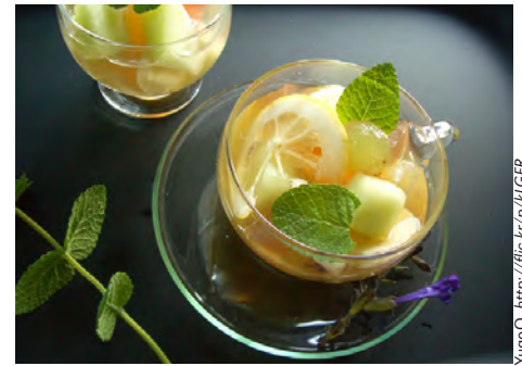
Mint (with fruit)