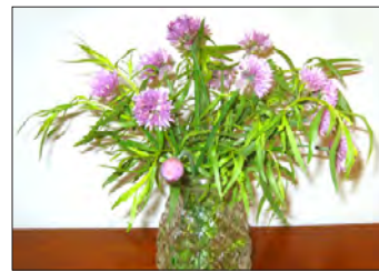
If you have extra herbs, enjoy herbal bouquets.

A general guideline when using fresh herbs in a recipe is to use 3 times as much as you would use of a dried herb. When substituting, you'll often be more successful substituting fresh herbs for dried herbs, rather than the other way around. For example, think potato salad with fresh versus dried parsley!