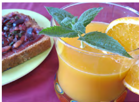
Mint (in smoothie)