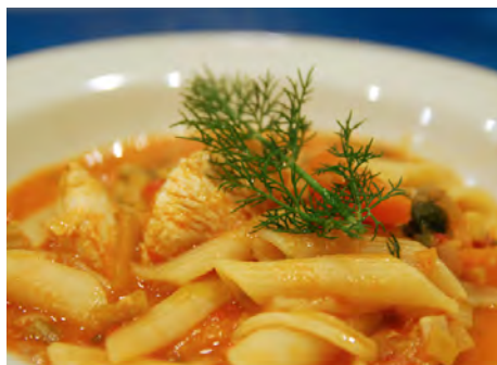
Dill (small, tender sprig)