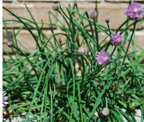
Many herbs, such as chives, can easily be grown in a container or garden.

Experience what a difference in appearance and flavor fresh herbs can make. Better yet ... they do this without adding extra calories! For example, top a baked potato with a dollop of yogurt and a sprinkling of chives or parsley.