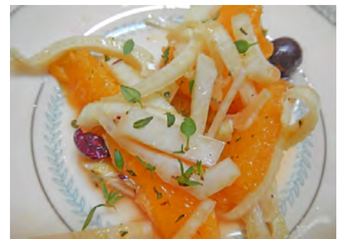
Thyme (individual tiny leaves)