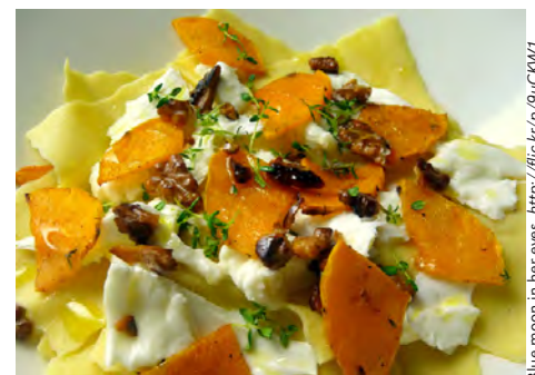
Thyme (young thyme with tender, edible stems)