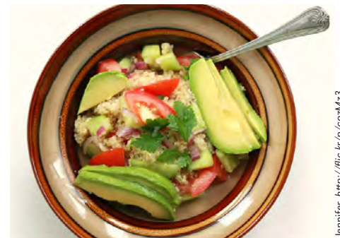
Parsley (leaves of flat-leafed parsley)